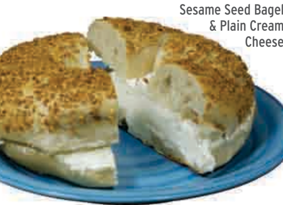
Sesame Seed Bagel & Plain Cream Cheese

(1) 1.29 (6) 7.29 (13*) 13.50 blueberry • cinnamon raisin • everything oat • cranberry almond • garlic • jalapeno- plain • rye • onion • poppy seed • wheat pumpnickel • sesame seed • monthly special sun-dried tomato