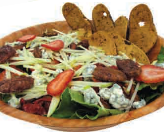
Strawberry & Blue Cheese Salad