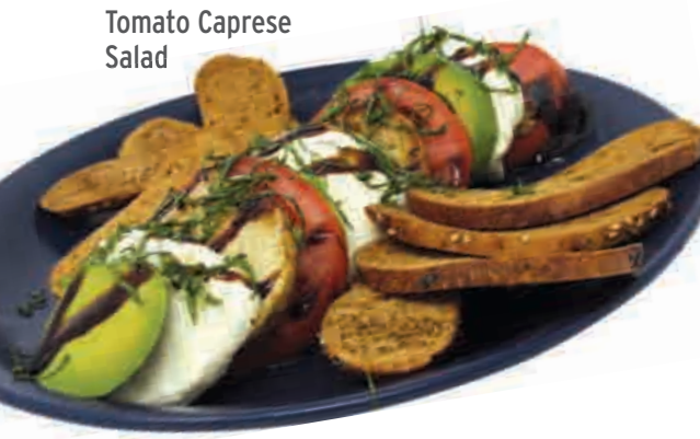
Tomato Caprese Salad

TOMATO CAPRESE SALAD ◆ Balsamic Reduction Grilled chicken, buffalo mozzarella, tomato & sliced avocado. Served with bagel chips. 9.99