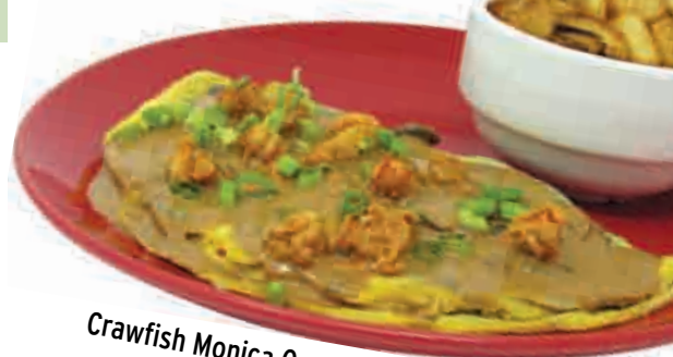
Crawfish Monica Omelet