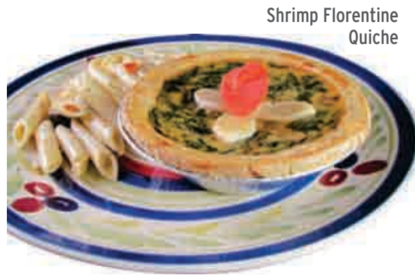
Shrimp Florentine Quiche

SIDE SALAD Romaine, tomato, cucumber, carrot & red onion. 4.49